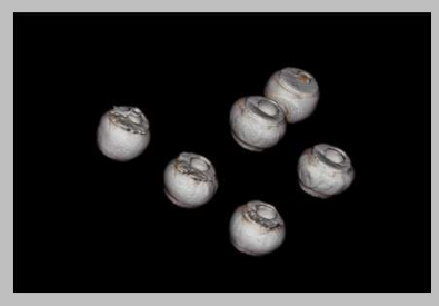
3D view of defective balls